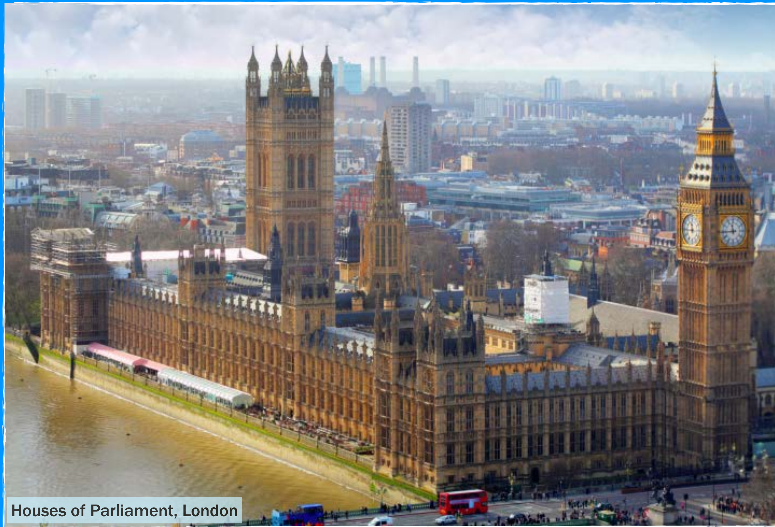
Houses of Parliament, London

A capital city is the city from which the country is run. It is where the government meets and is the administrative centre for the country.