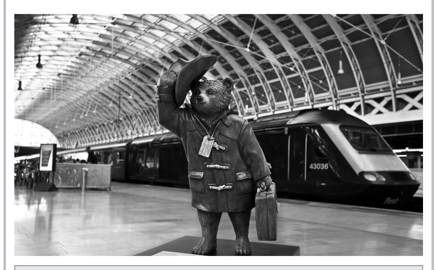
The bronze statue of Paddington on platform 1 at Paddington station.