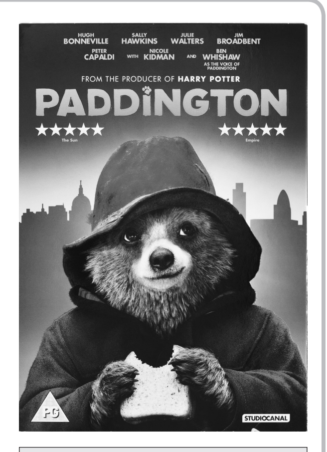
Paddintgon appeared in a feature length film for the first time in 2014.

More than 150 books have been written about Paddington Bear, and he has starred in many TV programmes as well as a full-length film. A life-sized bronze statue of Paddington can be found on Platform 1 at Paddington station, close to where he first met the Browns.