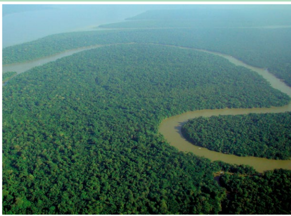
"Aerial view of the Amazon Rainforest"

Where? South America How long? 6,400km How wide at its widest point?