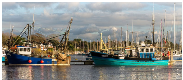
"Fishing boats on Lymington River"